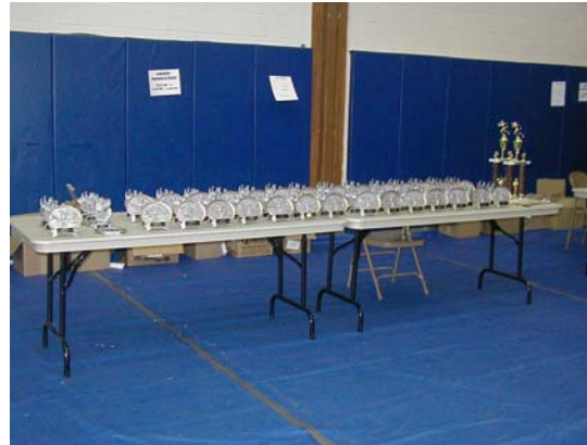
Awards do we have awards!