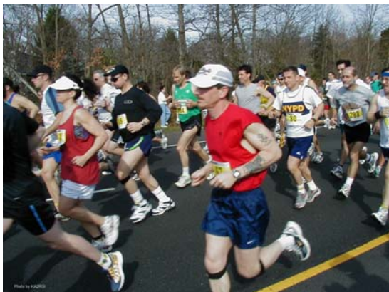
Runners along event course